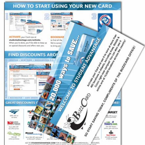
CUSTOMIZED FULFILLMENT KIT FOR BULK PURCHASE