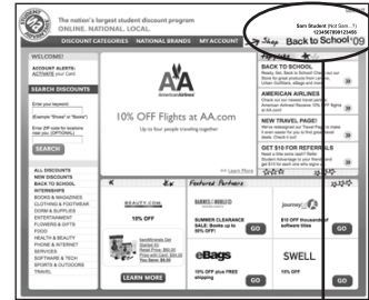
CARD NUMBER LOCATION